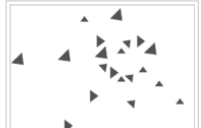
Rotating triangles made with Processing