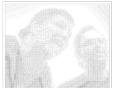
ASCII video image made with Processing